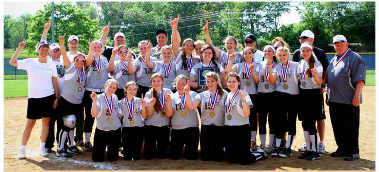
Holy Cross High School Crusaders PA Interscholastic Athletic Association 2013-2014 District II "AA" Softball Champions