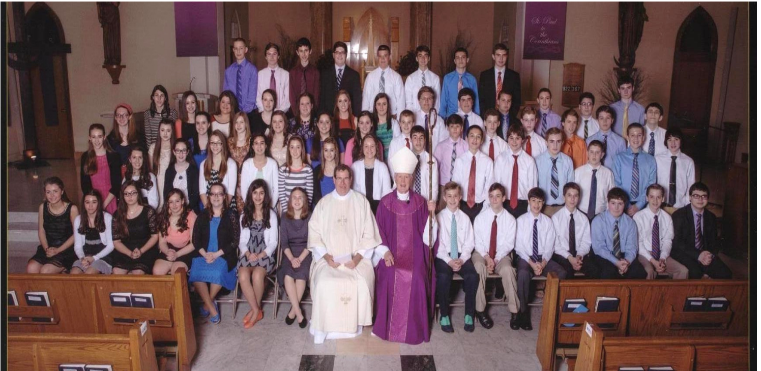
Our Lady of Mount Carmel Parish 2014 Confirmation Class